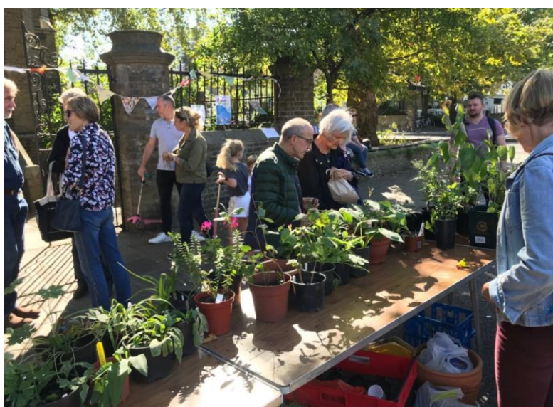
Plant Stall at Flower & Produce Show

De Beauvoir Gardeners continues to serve the communities of De Beauvoir, Dalston, London Fields, Islington and beyond with monthly meetings, outings and activities.